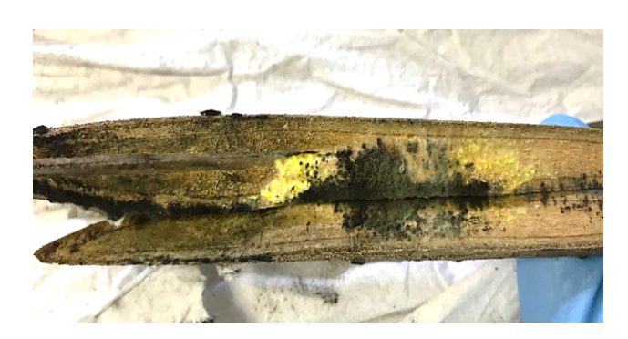
Figure 1. Lesions associated with the presence of fungi in mangrove stems.