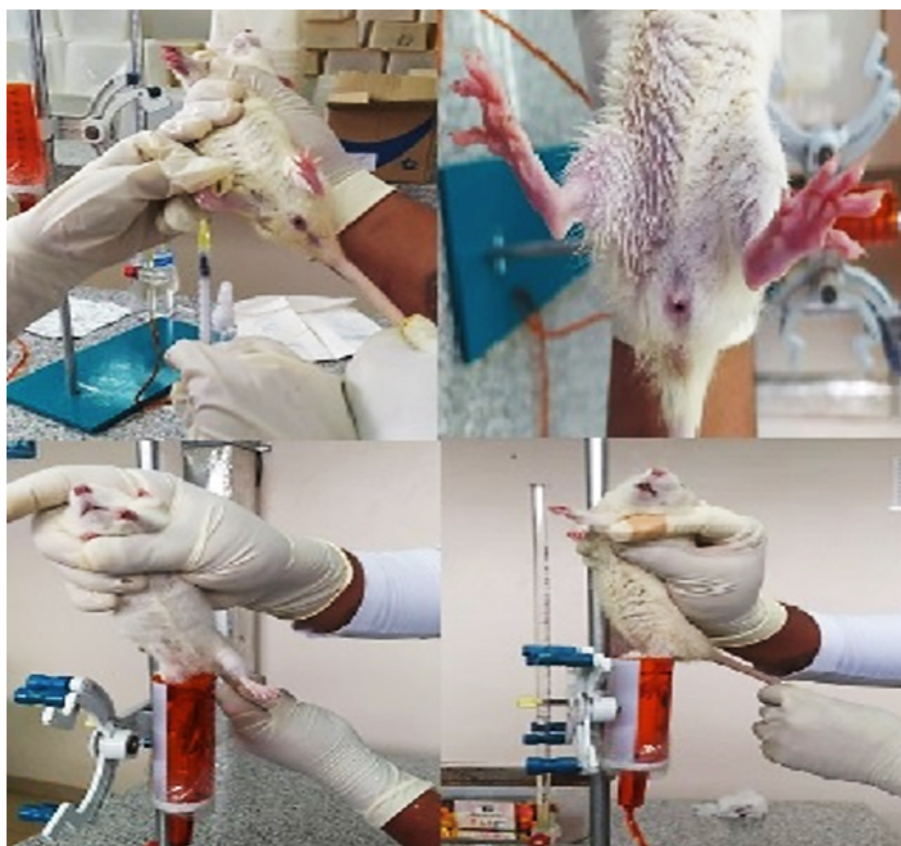
Figure 1. Graphical scheme of the carrageenan-induced subplantar edema method and measurement in a manual plethysmometer.

ted using the Ancovac test. The Anova analysis was performed in a one-way model to determine a significant difference between the means. The differences between each of the groups compared to others were observed in the three measurement times after the treatment was applied to determine which treatment is the most effective against inflammation, considering the control and positive control groups (formulation with diclofenac at 1%). Subsequently, an Anova study was performed in a linear model to see the behavior of each of the treatments